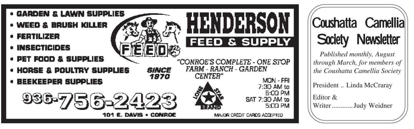
September meeting - continued from front page

quality camellias and sasanquas for our sale. If you have a special request for a certain plant, please let Dick know at the meeting.